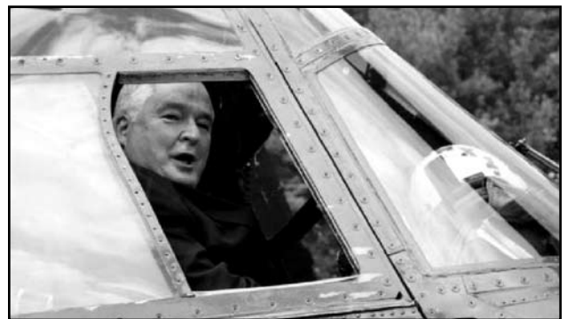
"Ready APP" TBS MCB Quantico, August 2004