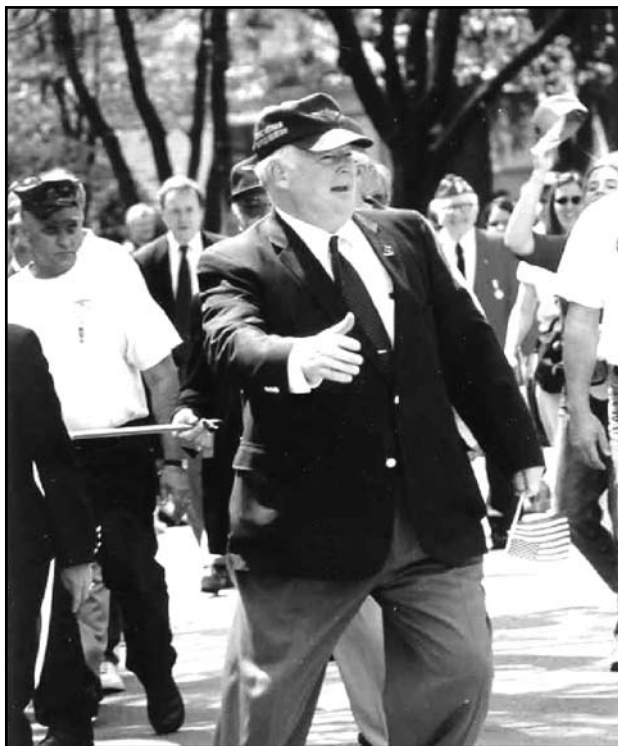
Team from mountains west of An Hoa Chicago Memorial Day – Grand Marshall Beverly Hills – Morgan Park 27 May 2002