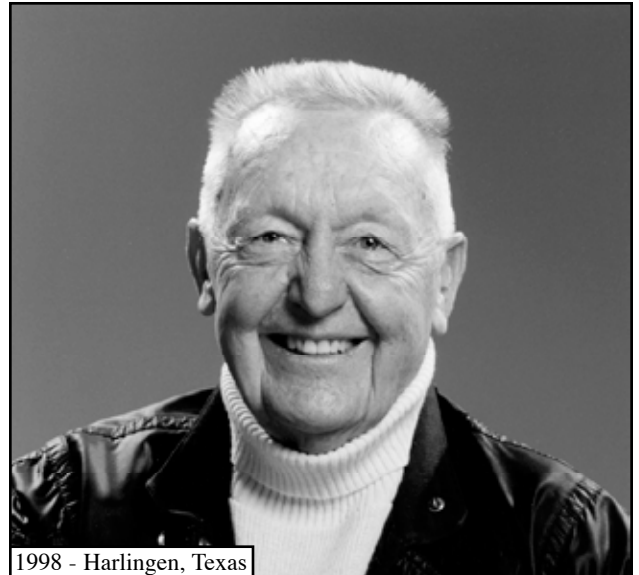
1998 - Harlingen, Texas