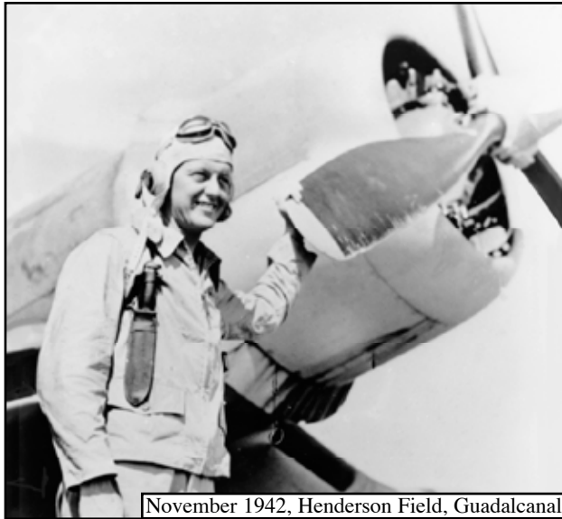
November 1942, Henderson Field, Guadalcanal