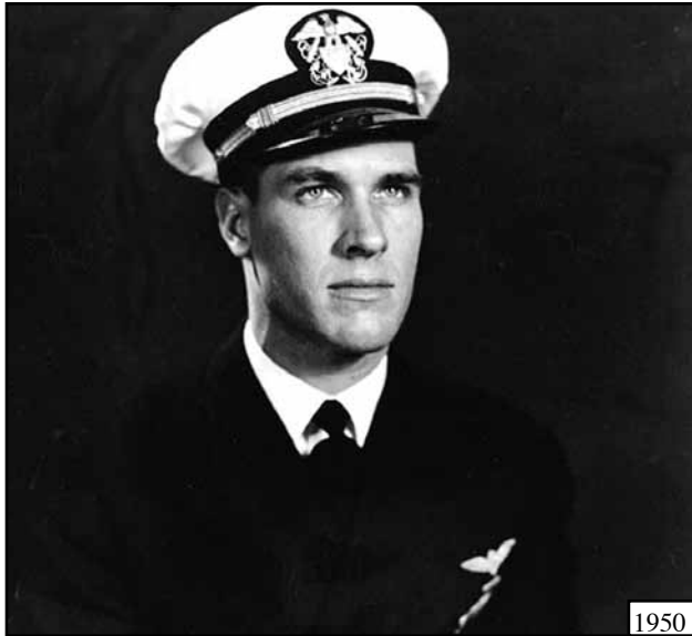
CAPT Thomas J. Hudner Jr., USN (Ret.) “Tom”

Date of Designation: 12 August 1949 NA # T-5