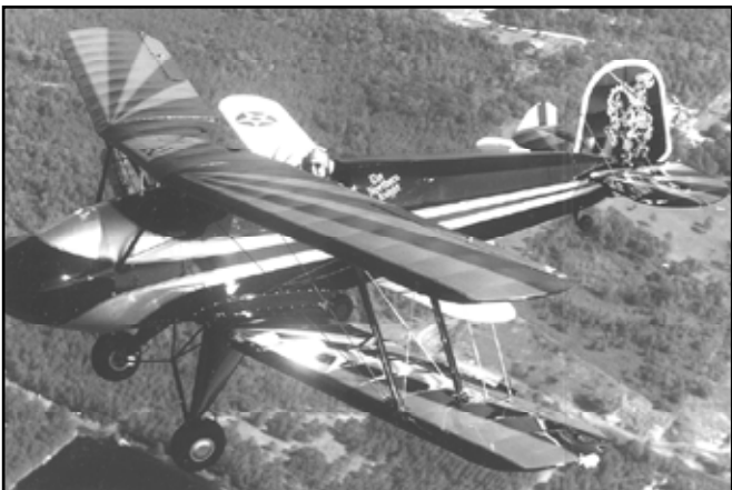
My favorite Bucker Yungmann