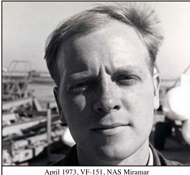
April 1973, VF-151, NAS Miramar