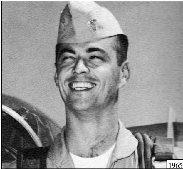
Robert L. Crippen CAPT USN (Ret.) "Crip"