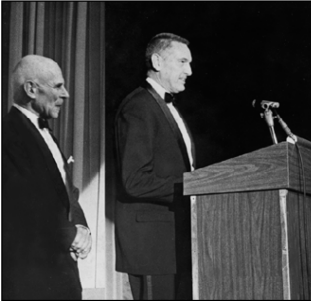
Receiving original J. H. Doolittle award from Jimmy Doolittle